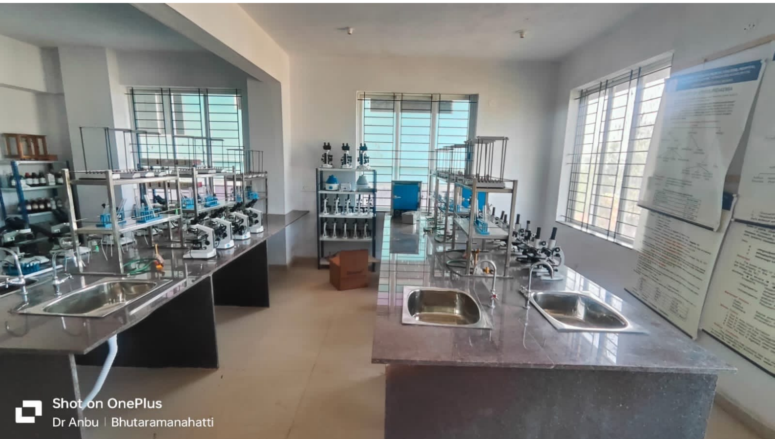
Bhutaramanahatti